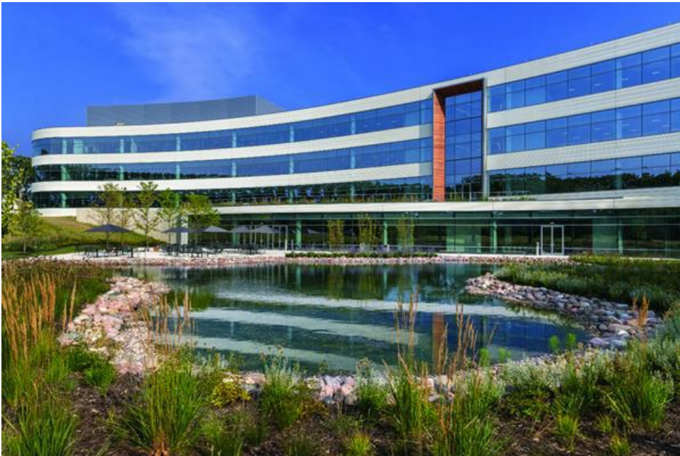
The Chamberlain Group Corporate Headquarters