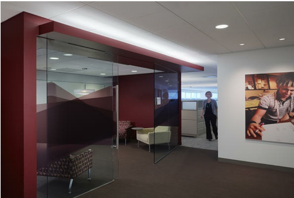
Career Education Corporation Headquarters