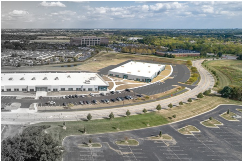
Blazer Tech II Office