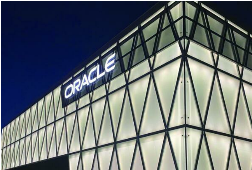
Oracle Industries Innovation Lab