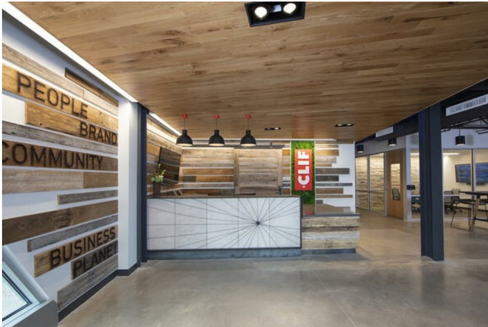
CLIF Bar Baking Company of Indianapolis Renovation and Expansion