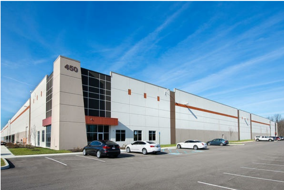
Hanzo Logistics Headquarters & Warehouse