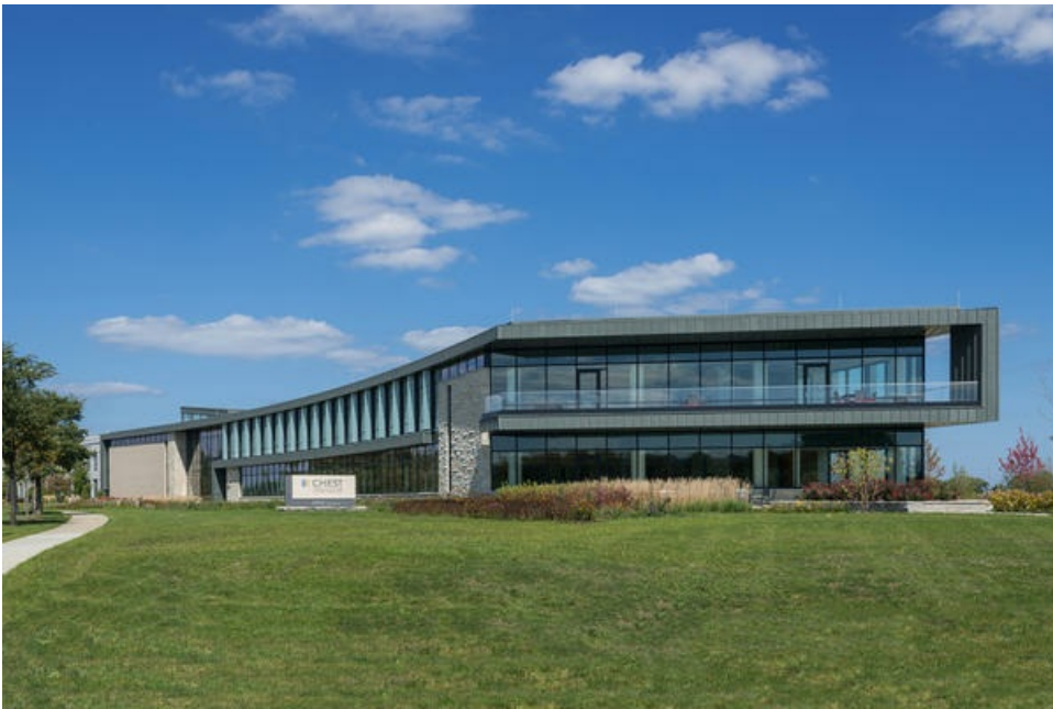
American College of Chest Physicians Global Headquarters