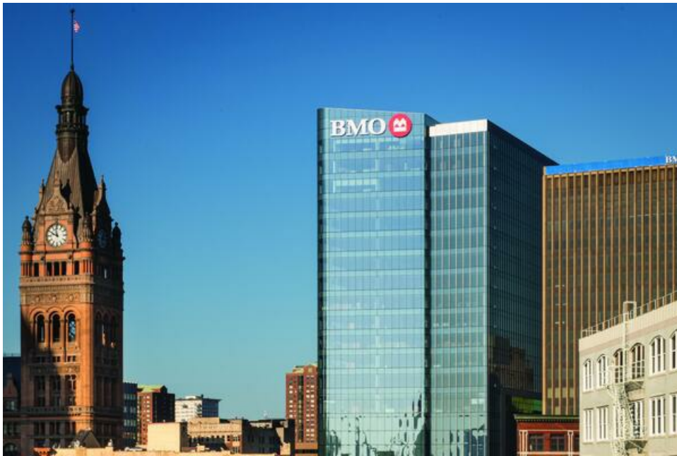
BMO Tower - Milwaukee