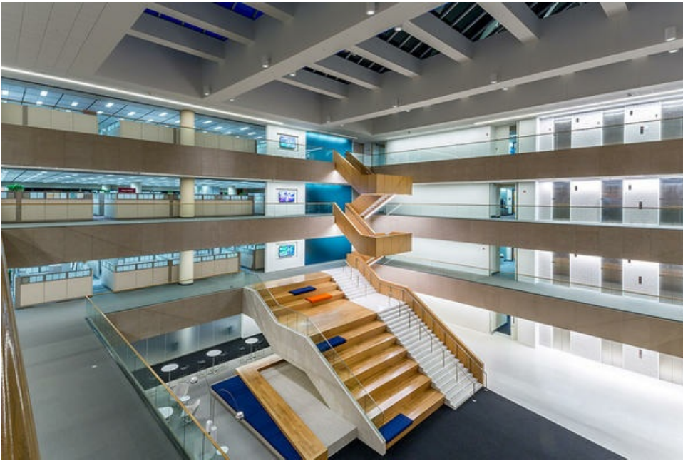
Online Computer Library Center (OCLC) renovation