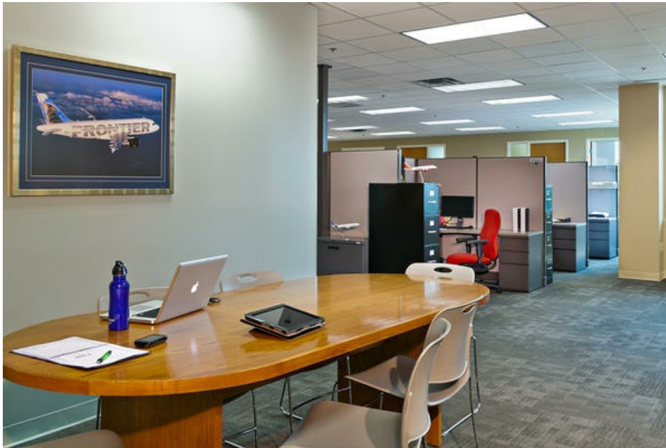
Republic Airways Corporate Headquarters Renovation