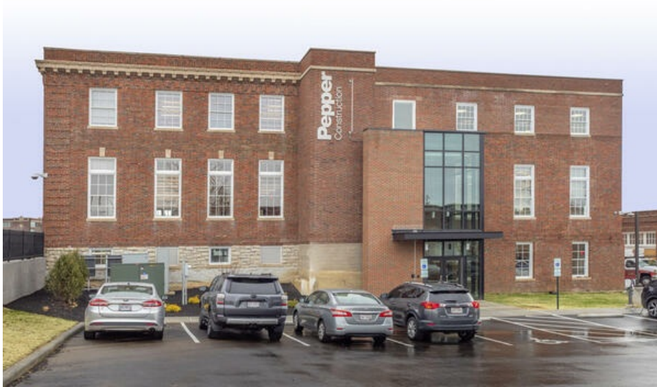
Pepper Construction Cincinnati Office