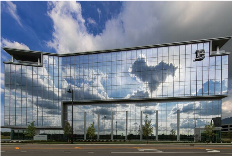
The Boler Company Headquarters