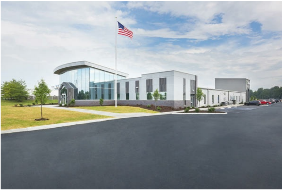
AgReliant Genetics Headquarters Renovation