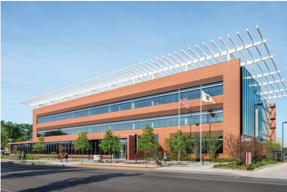
ComEd Chicago North Headquarters