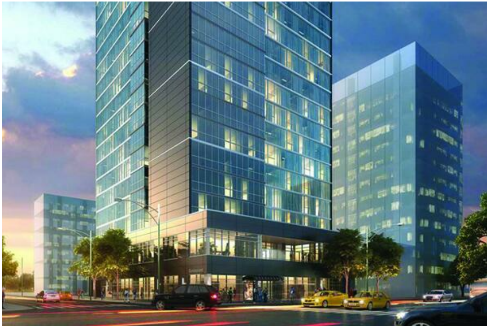
110 West Huron