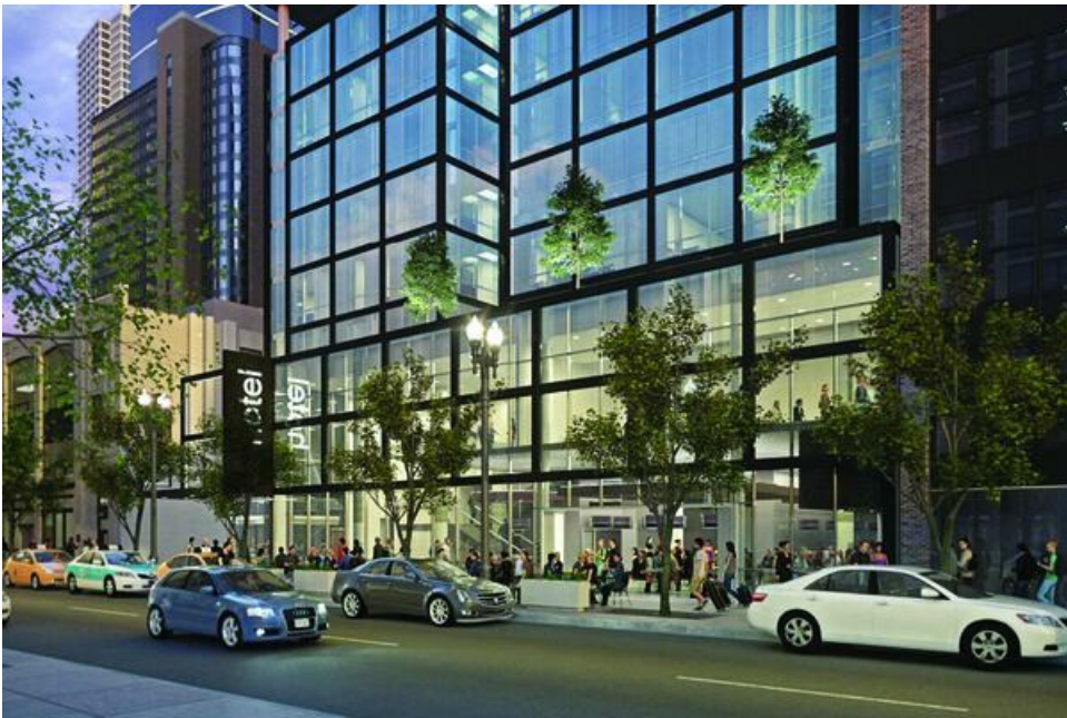
Aloft Chicago Mag Mile