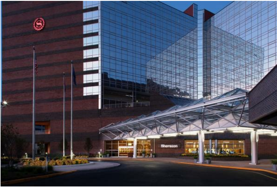
Sheraton Indianapolis Hotel at Keystone Crossing