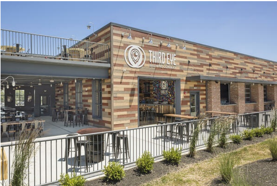
Third Eye Brewing Company Brewery and Restaurant