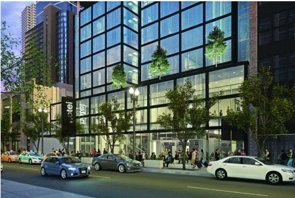
Aloft Chicago Mag Mile