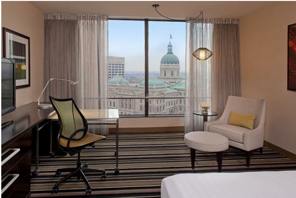
Hyatt Indianapolis Guest Room Renovation