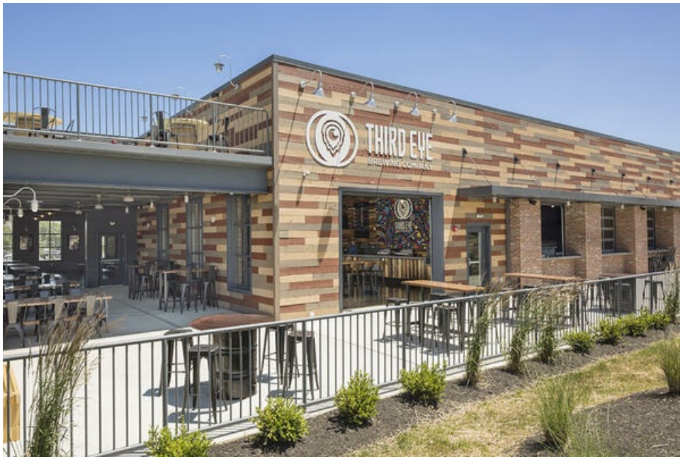
Third Eye Brewing Company Brewery and Restaurant