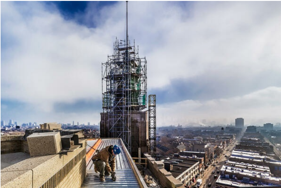
The Robey and The Robey Hall