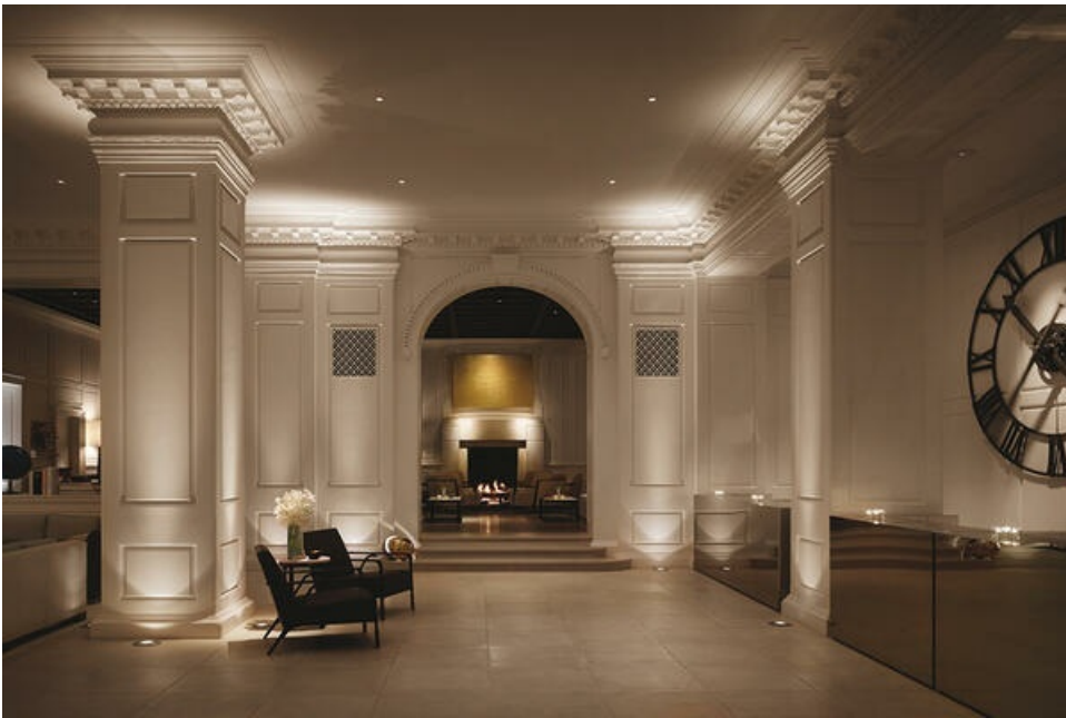
Public Hotel Chicago