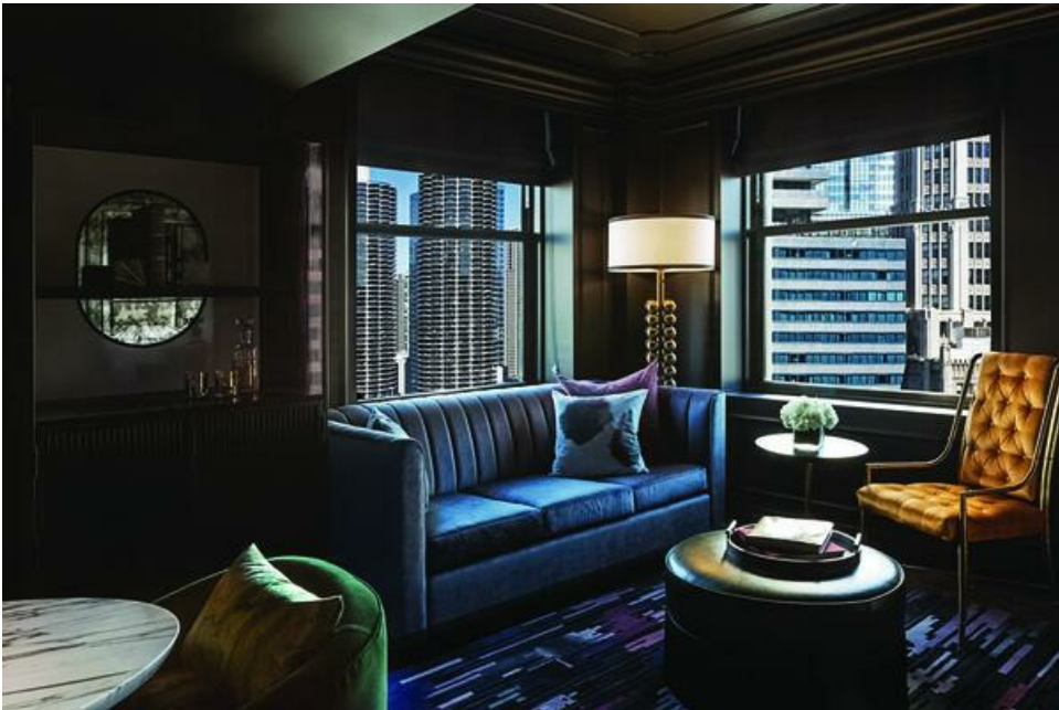
St. Jane Hotel