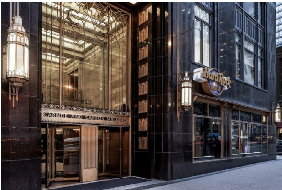
Hard Rock Hotel