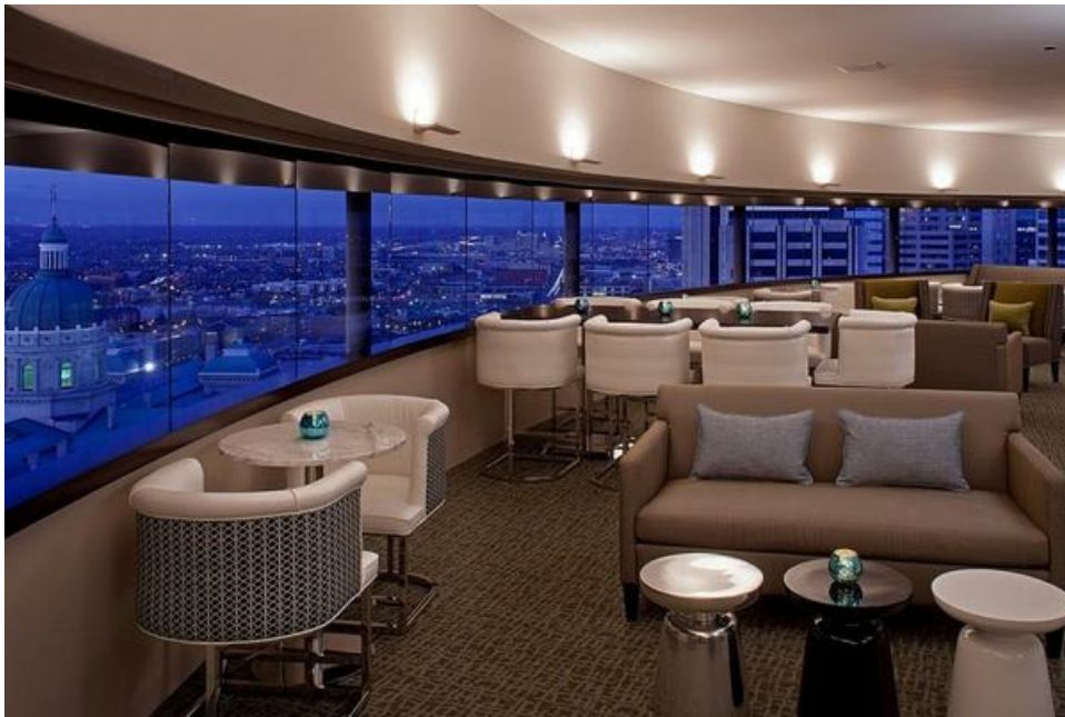
Eagle's Nest Restaurant