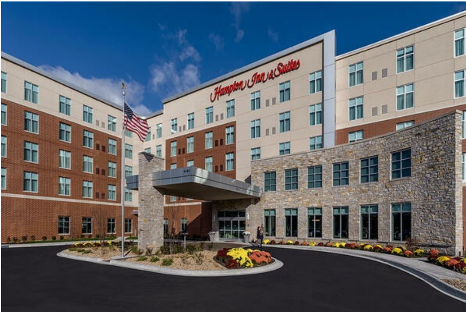
Hampton Inn Rosemont