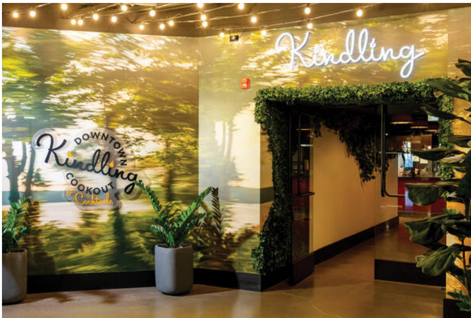
Kindling Cookout & Cocktails