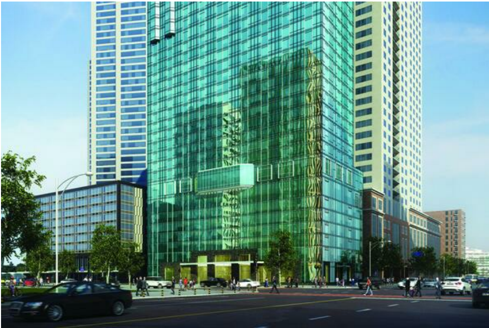
1101 South Wabash