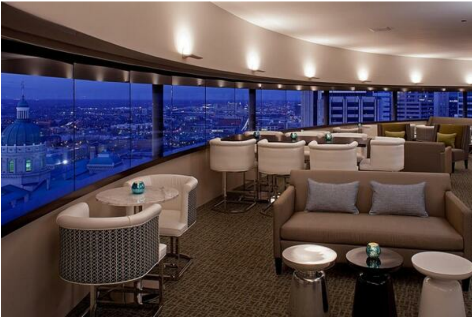
Eagle's Nest Restaurant