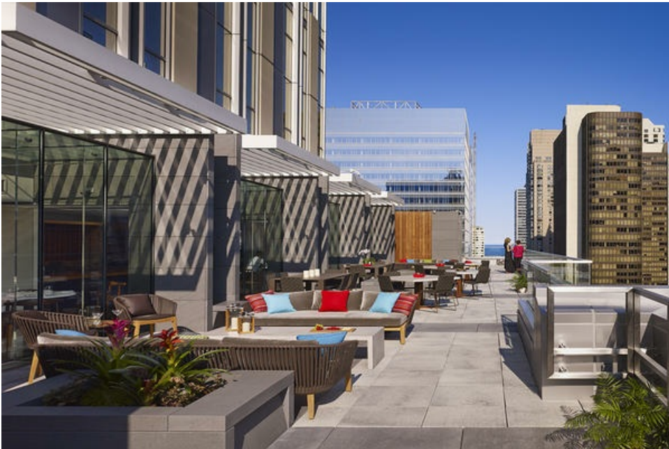
GreenRiver at 259 East Erie