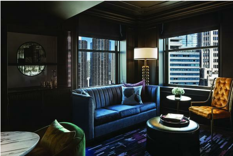
St. Jane Hotel