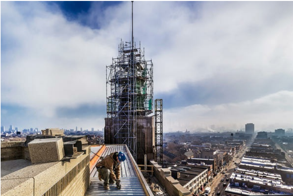
The Robey and The Robey Hall