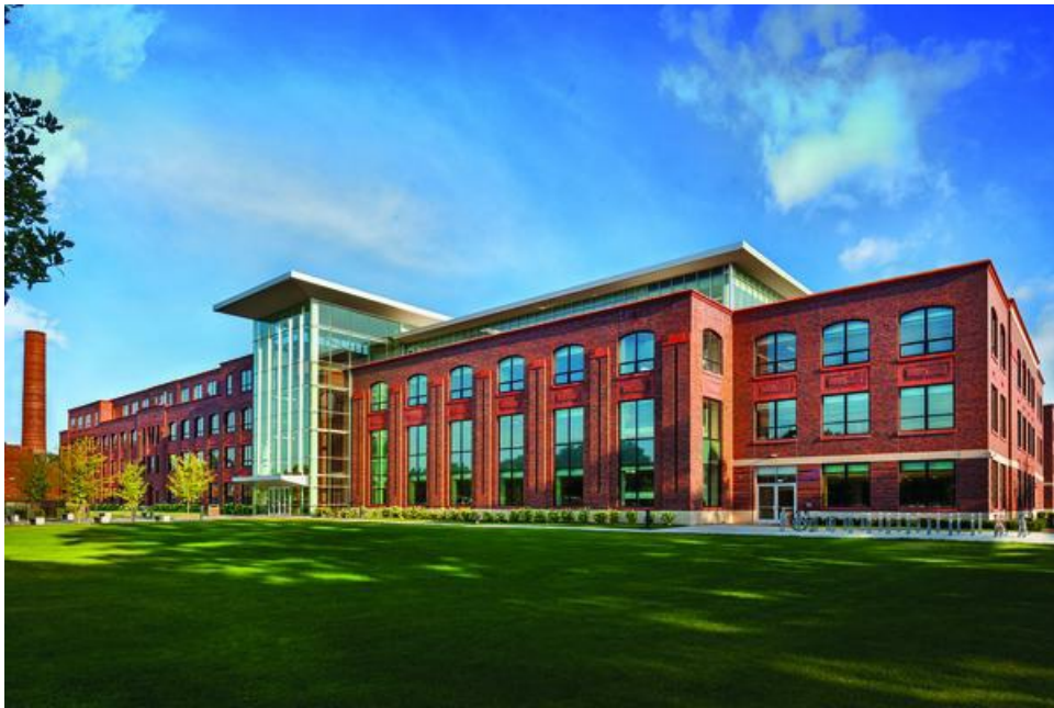
New Trier High School Winnetka Campus Expansion