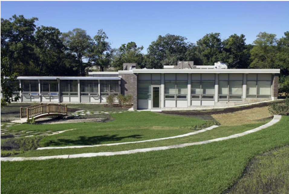
Woodlands Academy of the Sacred Heart