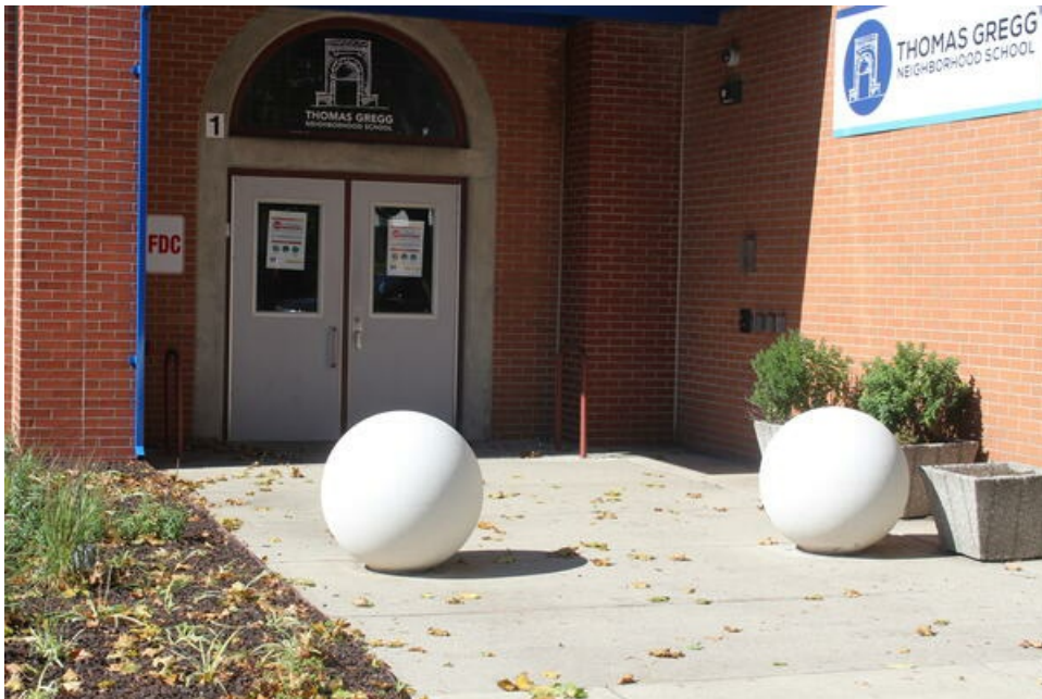
Indianapolis Public Schools Safety and Modernization Efforts