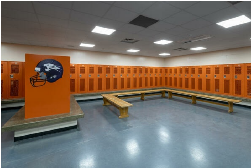
North Putnam Community Schools Elementary, Middle and High School Renovations