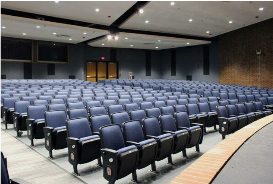
South Dearborn High School Addition and Renovation