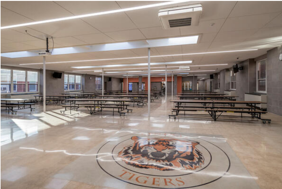
School District 155