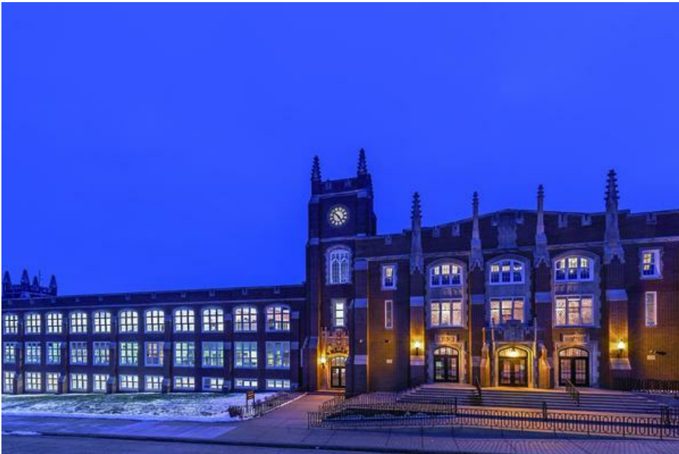
LaSalle-Peru Township High School District 120 Facilities Master Plan