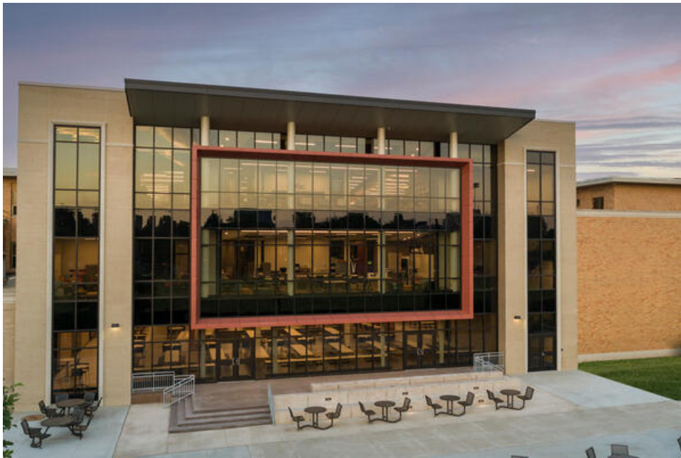
Oak Park and River Forest High School District 200