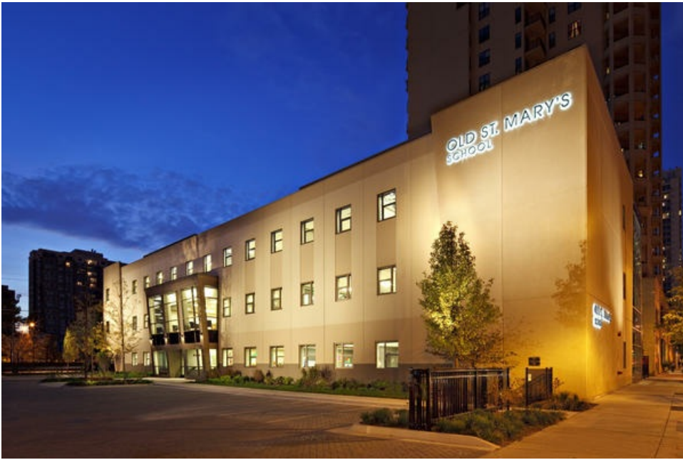
Old St. Mary's School and Parish Center