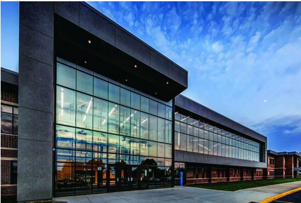
West Chicago Community High School District 94