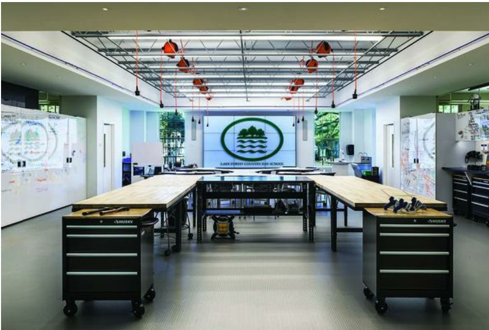
Lake Forest Country Day School Innovation Center