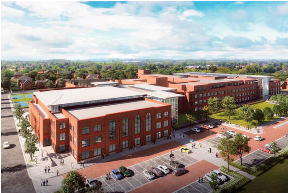
New Trier High School, East Side Academic and Athletic Project