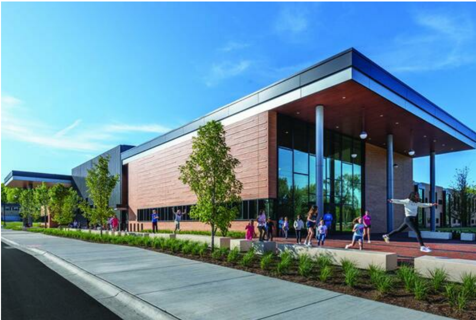
Lisle Community Unit School District 202 New Elementary School