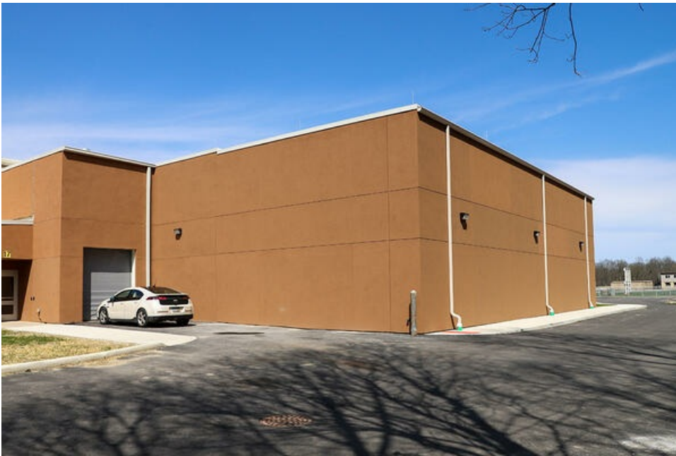
Buckeye Valley Band Room Addition