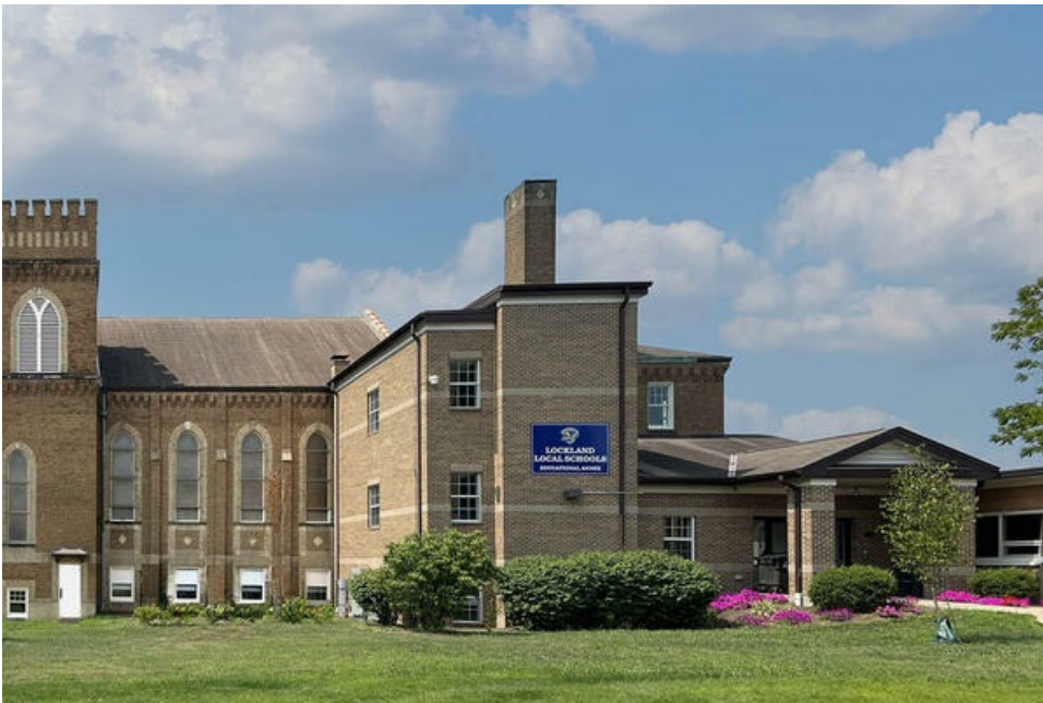
Lockland Educational Annex Building Renovation