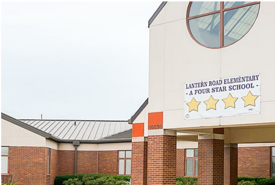
Hamilton Southeastern Schools Lantern Road Elementary