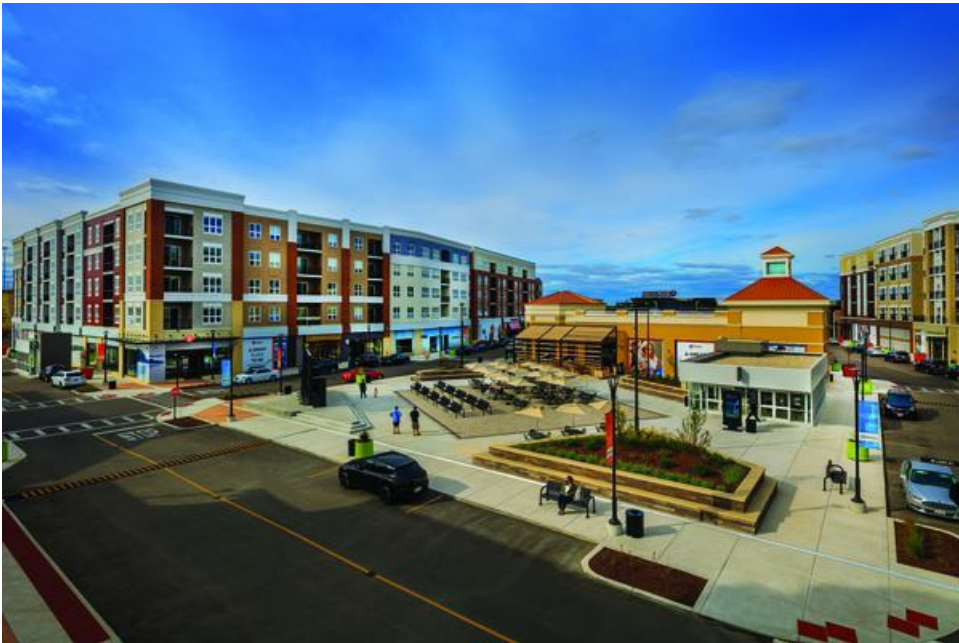
The Corners of Brookfield