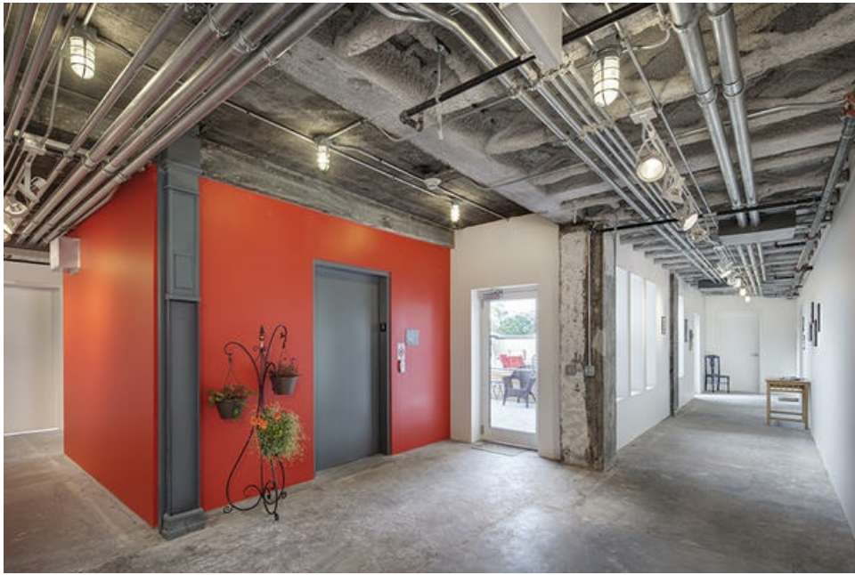
Karcher Artspace Lofts