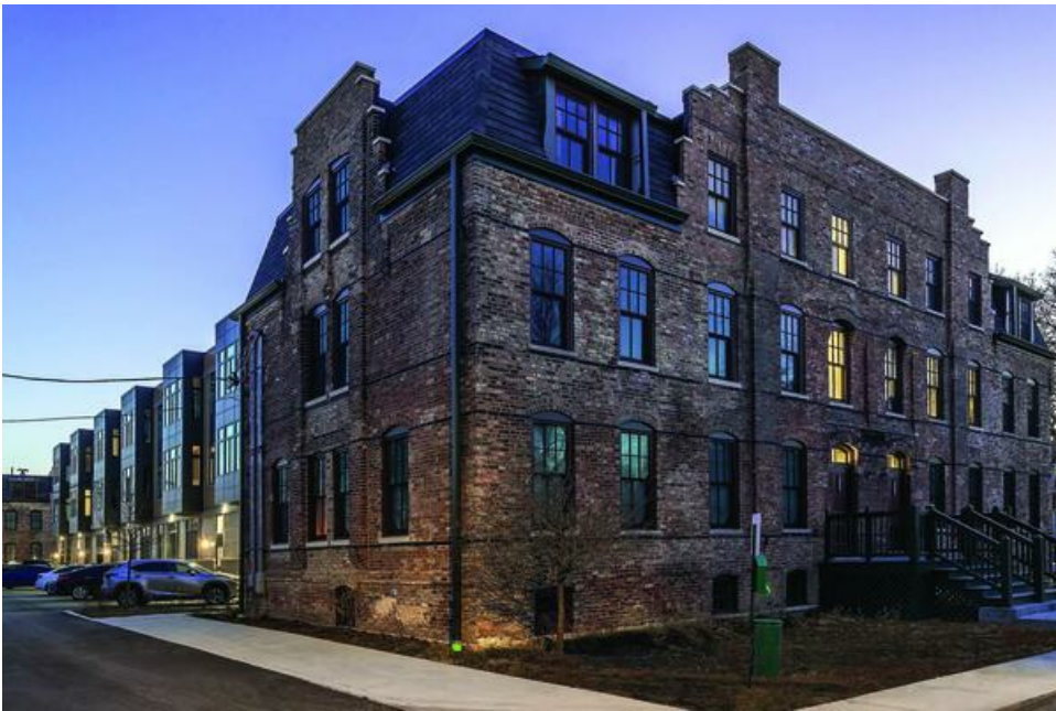
Pullman Art Lofts