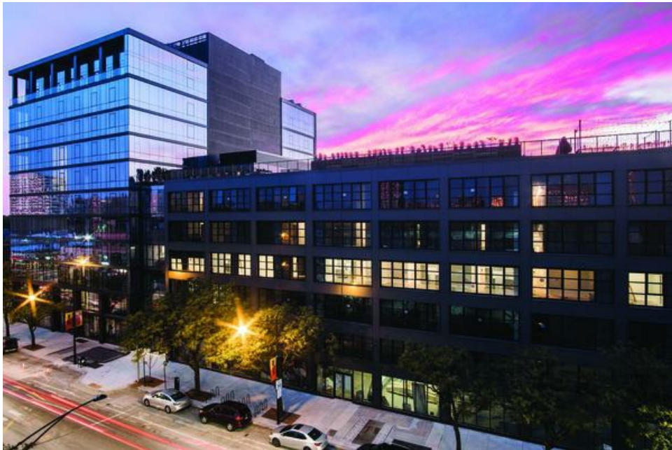
The Draper at 5050 N Broadway