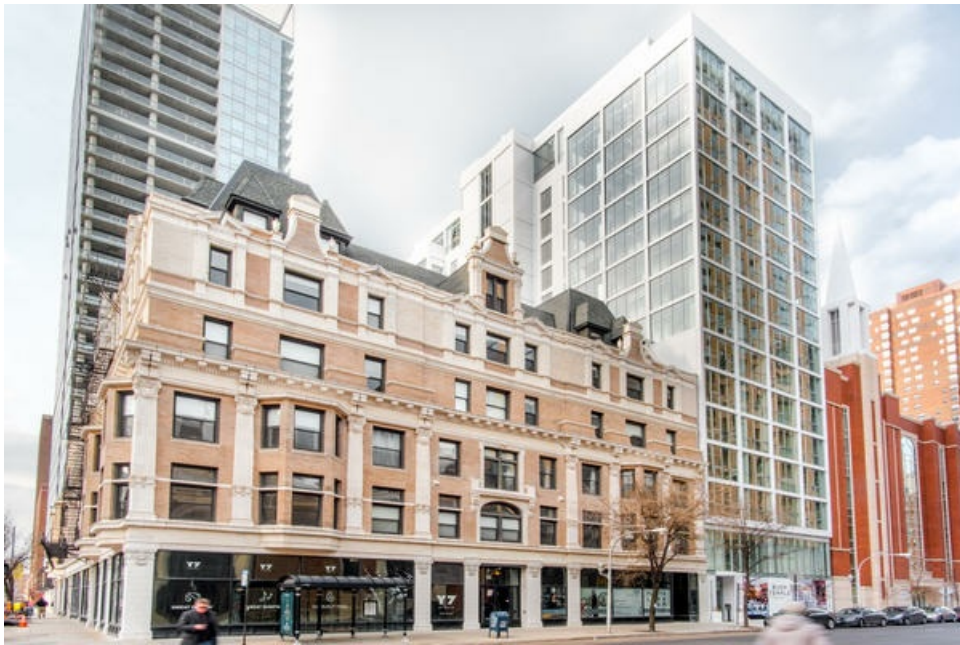
810 N Clark Apartments