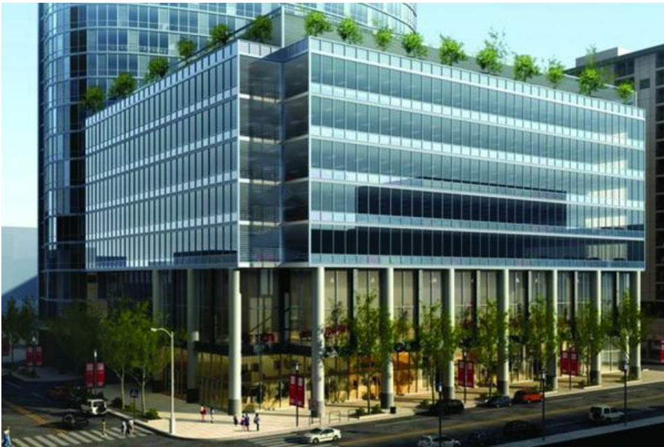
One South Halstead