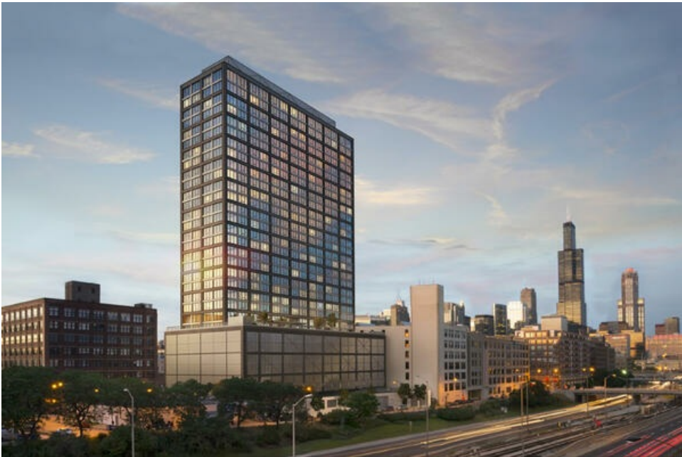
1035 West Van Buren Street