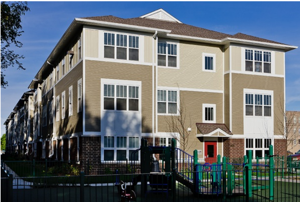
Homan Square Apartments