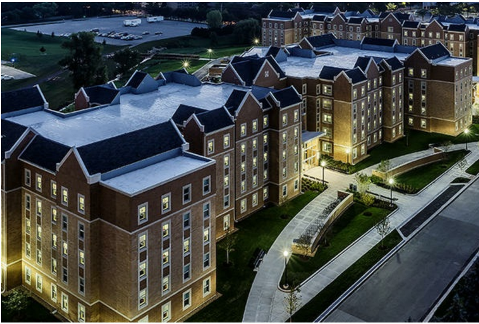
Northern Illinois University New Residence Hall