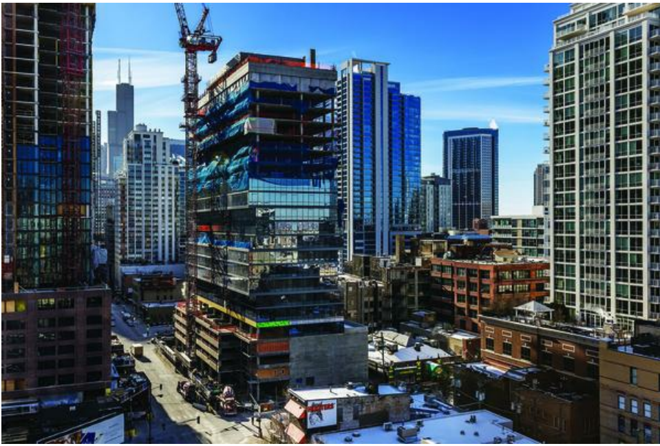
640 North Wells Street