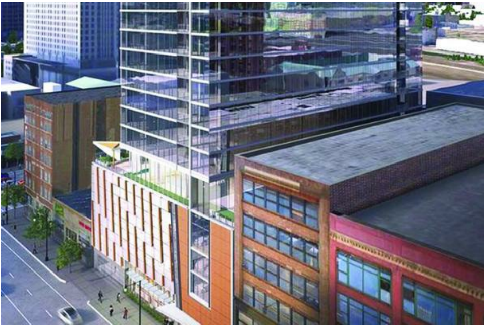
1136 South Wabash