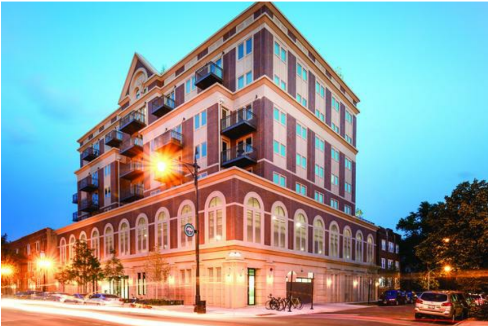
1323 W. Morse Apartments