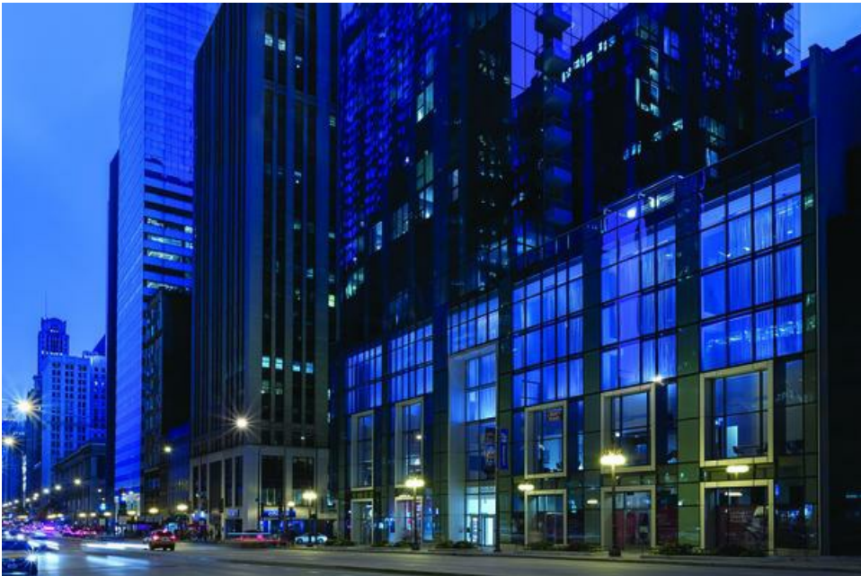
MILA at 200 North Michigan