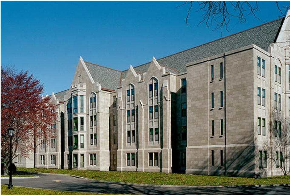
Dominican University Centennial Hall