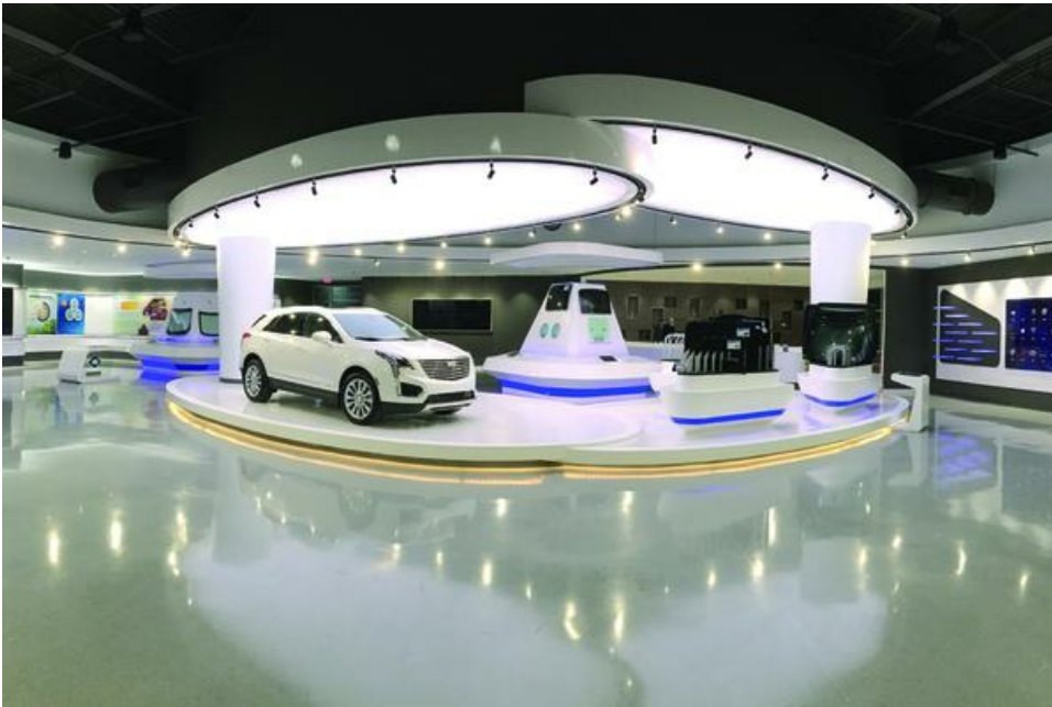
Fuyao Glass America Showroom buildout