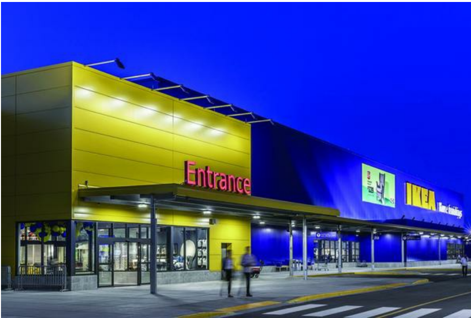
IKEA Oak Creek