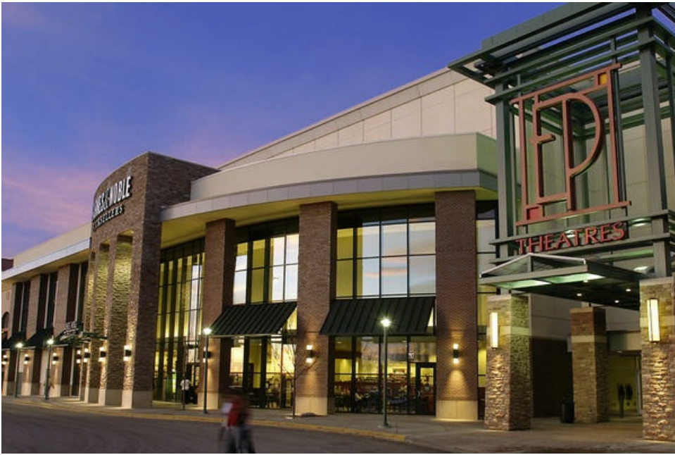
Edin Prairie Center