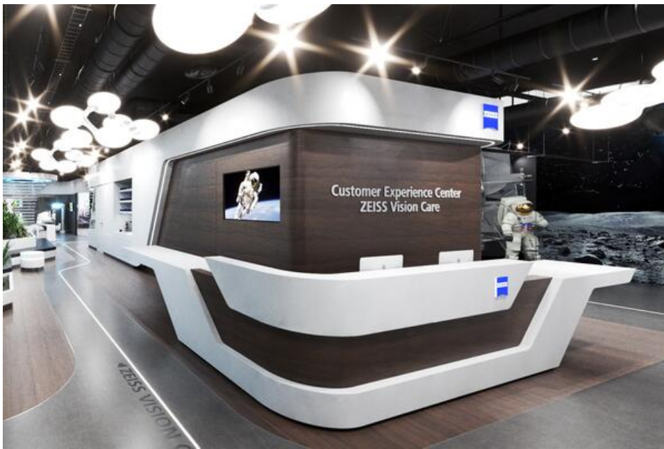
ZEISS Customer Experience Center Interior Renovations