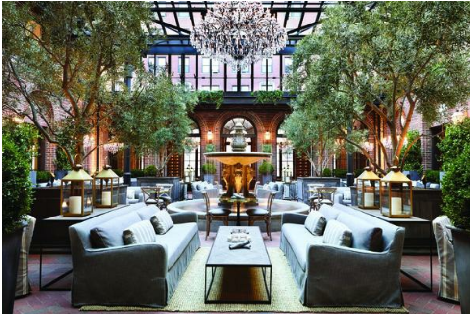
RH Gallery at The Three Arts Club