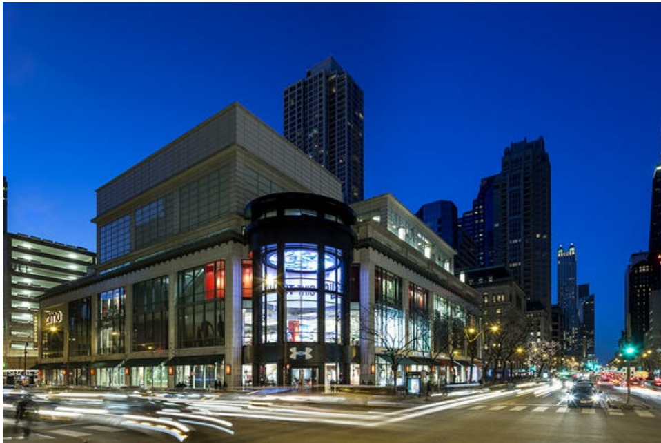
Under Armour Brand House Chicago