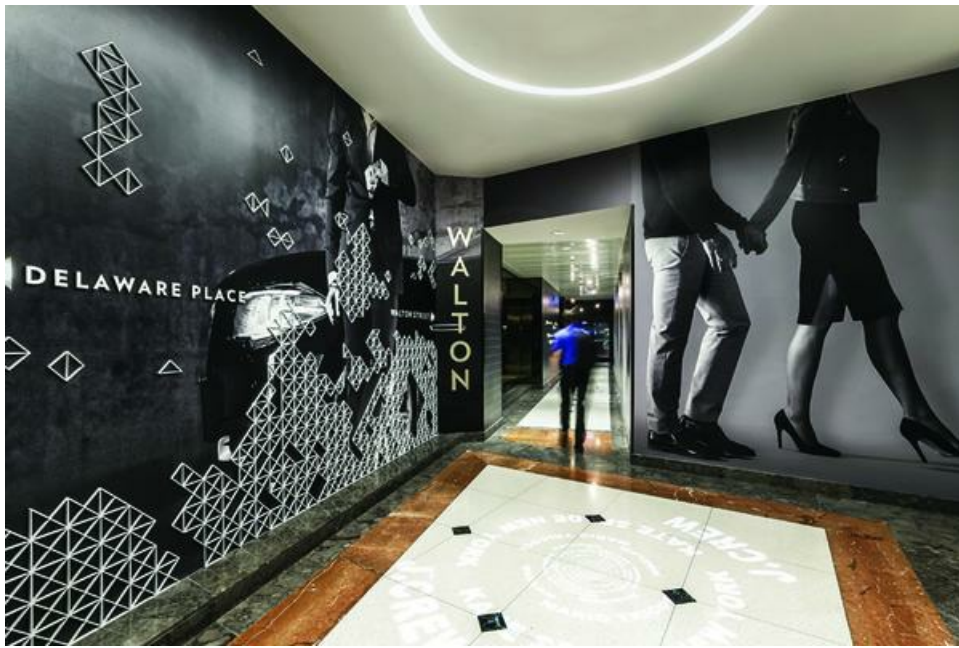
900 North Michigan Shops