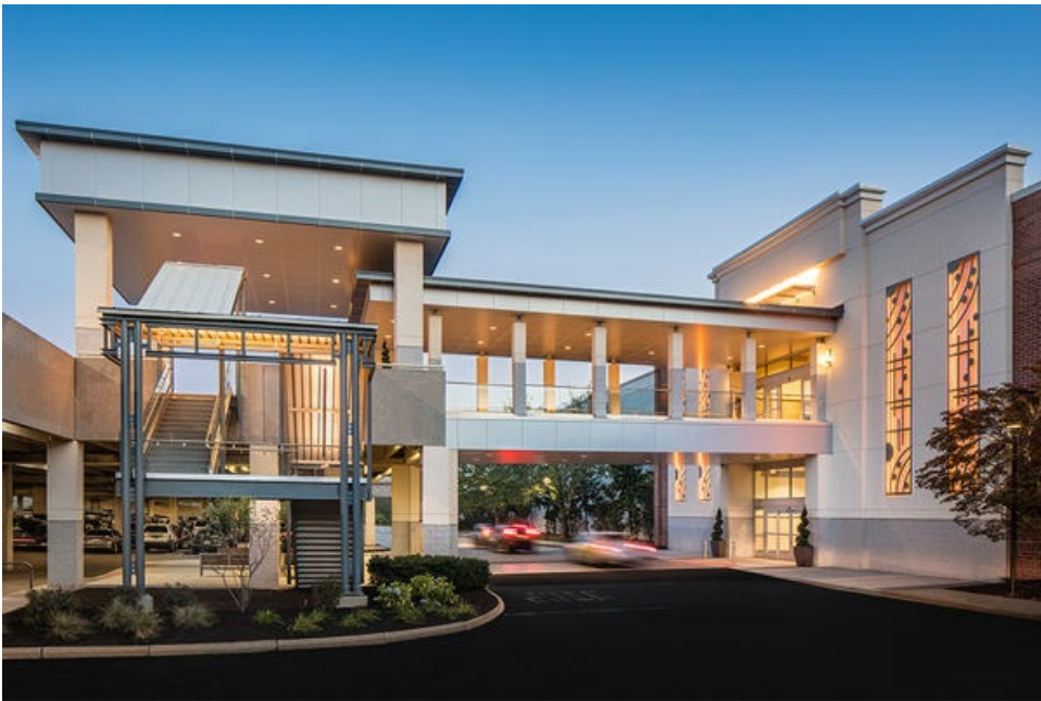
The Mall at Rockingham Park Renovation