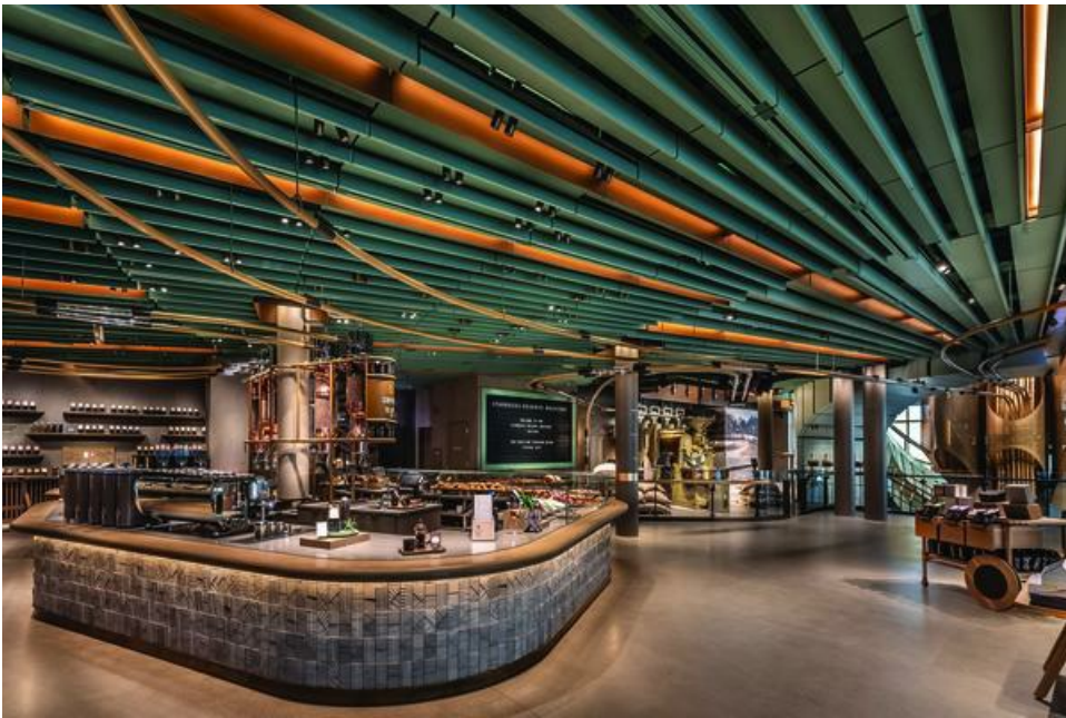
Starbucks Reserve Roastery Chicago