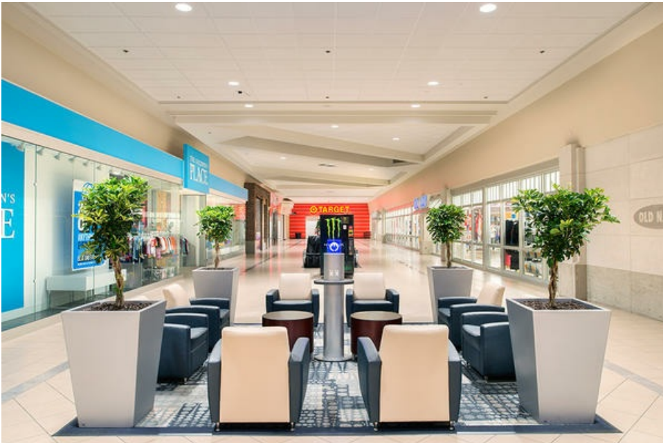
Markland Mall Renovation