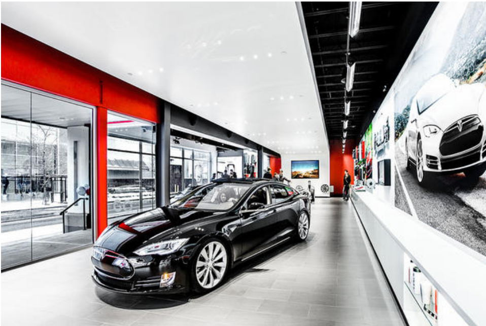
Tesla at Easton