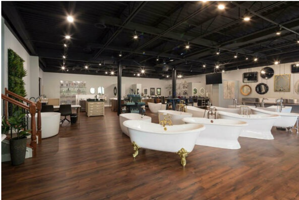
Signature Hardware Showroom Remodel